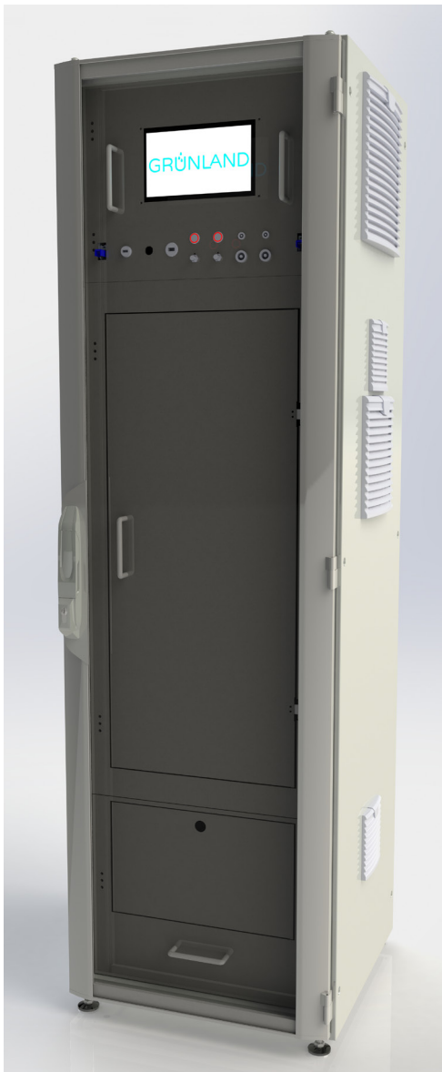
Fuel cell power generator

Electricity is generated from POWERPASTE and water in a fully automated fuel cell-based power generator, which doses both materials to match the hydrogen demand of its fuel cell at any time. The power generator thus operates at low pressures and allows a safe and simple start-up, shut down and POWERPASTE cartridge change without tools and within seconds.